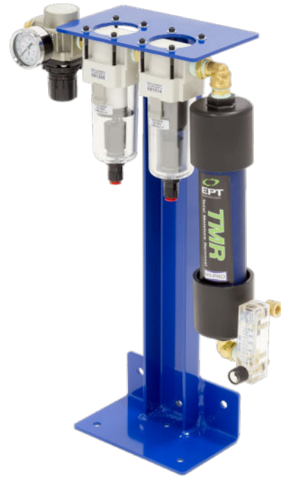
TMR ™ -Air Conditioned Reservoir

*TMR ® is a registered trademark of EPT CLEAN OIL.