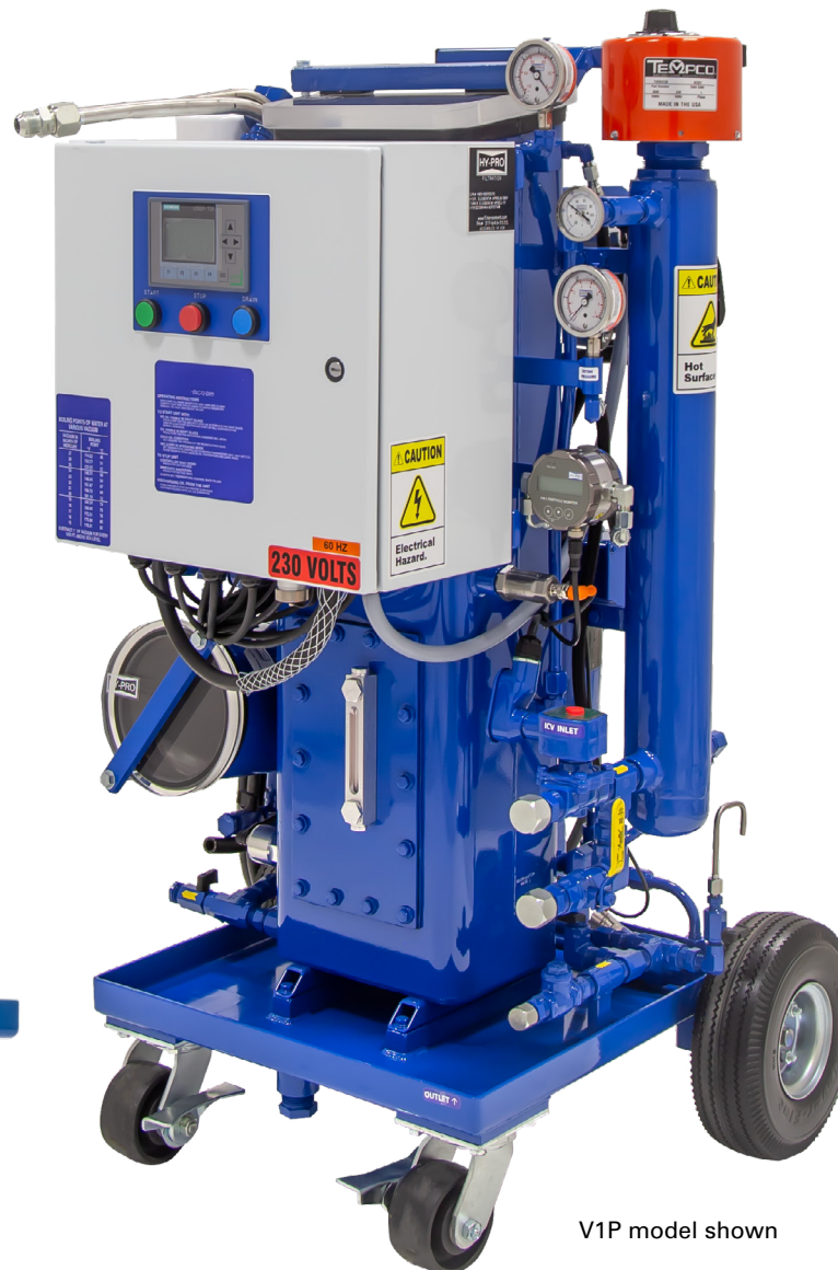
V1P model shown