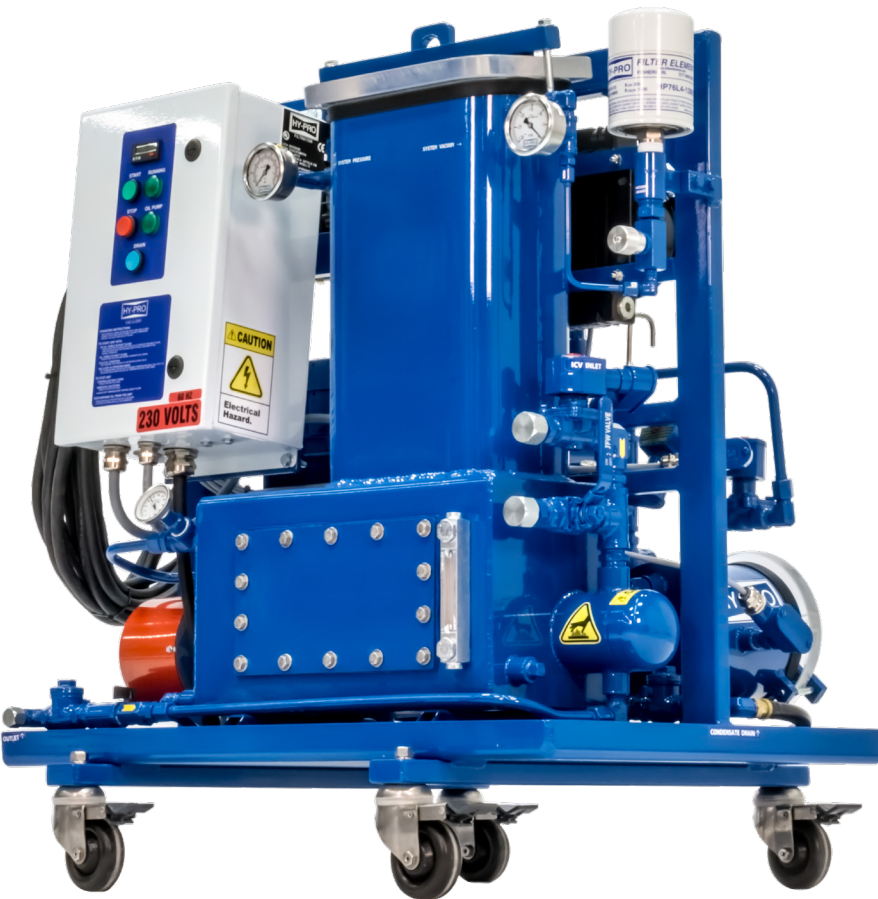
V1S model shown